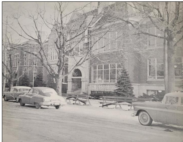
The high school on 4th Street, circa 1958