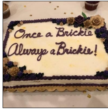
Cakes made for the Class of 1971 50th Year Reunion