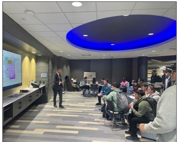
Presenting newly opened and planned PNW projects to a group of PNW students from the College of Technology

What do you like most about your position as Assistant Vice Chancellor at Purdue Northwest?